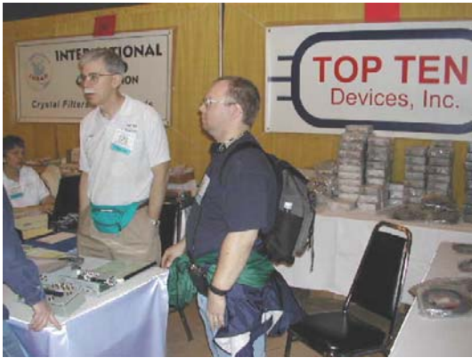
N3RD and N2SR