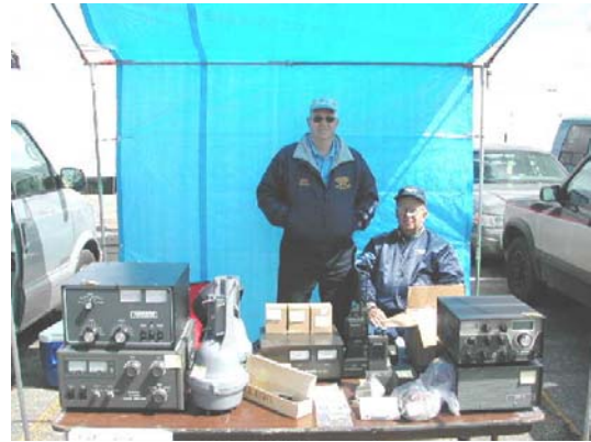
W2CG and K3NZ