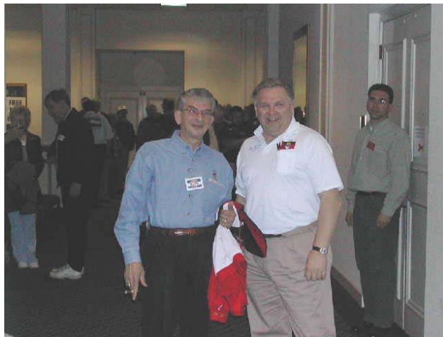
N2SS and N2TK